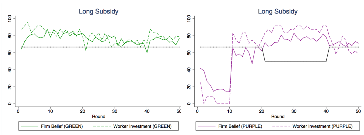
Figure 6: Firms' beliefs and workers' investment decisions in the Long Subsidy treatment