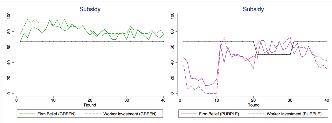
Figure 4: Firms' beliefs and workers' investment decisions in the Subsidy treatment