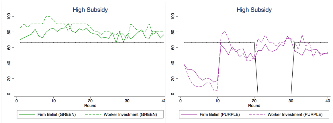
Figure 5: Firms' beliefs and workers' investment decisions in the High Subsidy treatment